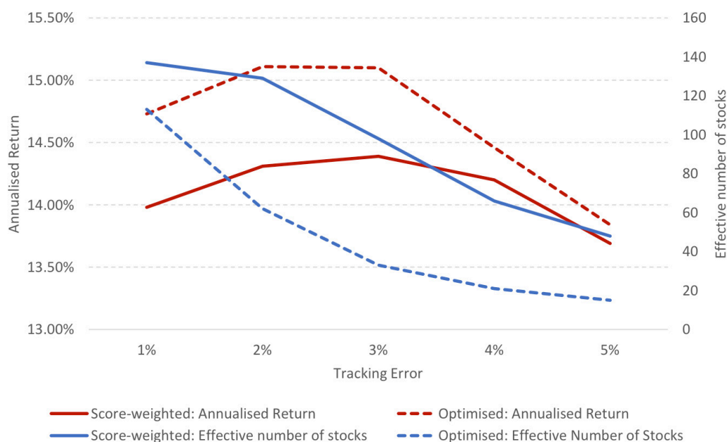
Exhibit 6: Performance and concentration as a function of tracking error

There are two reasons why exploiting scores more aggressively does not improve performance.